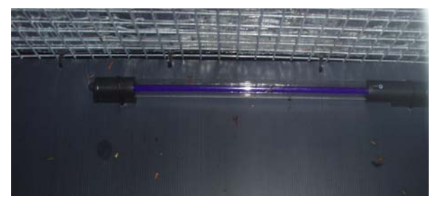
UV black lights available from electronics outlets

When the lights are on they attract insects, the insects in turn attract the toads. The toads push on the one way finger gates to enter the trap to feed on the insects and become captured. During their stay in the trap they feed at their own will at night and seek shelter and water from the trough during the day.