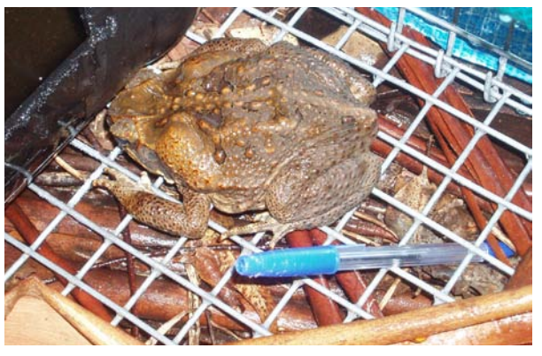
Cane toad caught in a super trap at Mebbin NP during a trial.

Toad carcasses can be disposed of by burial in a garden; ensuring that the depth is sufficient so native and domestic animals don't dig up the carcasses. Alternatively they can be placed in a lidded compost or garbage bin.