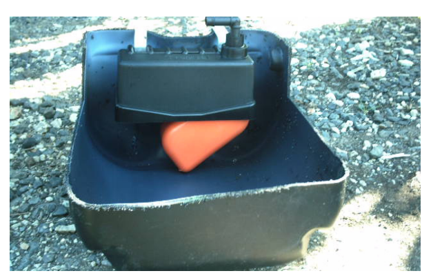
Trough and float valve supply water to captured toads