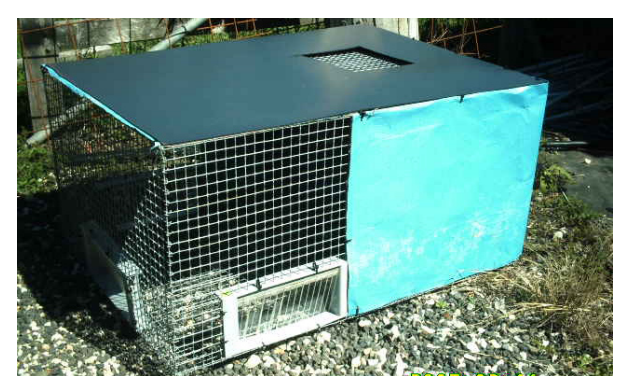
An example of a Super trap

When set up with adequate water and all parts functioning correctly, the Super Trap can house captured toads humanely for an extended period of time.