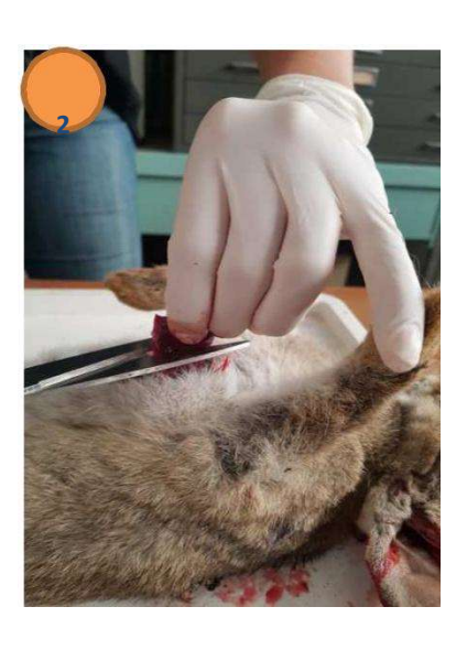
Step 2. Cut off a small piece of the liver (approx. 2cm x 2cm).