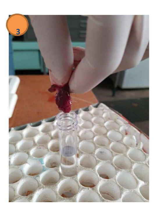
Step 3. Insert the liver sample into the sample container. Be careful not to displace the preserving liquid, and ensure the entire sample is submerged in the liquid.